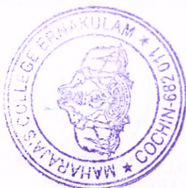
SPECIAL GRADE PRINCIPAL MAHARAJA'S COLLEGE ERNAKULAM